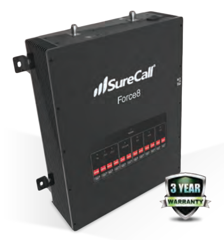
The SureCall Force8 Industrial Amplifier